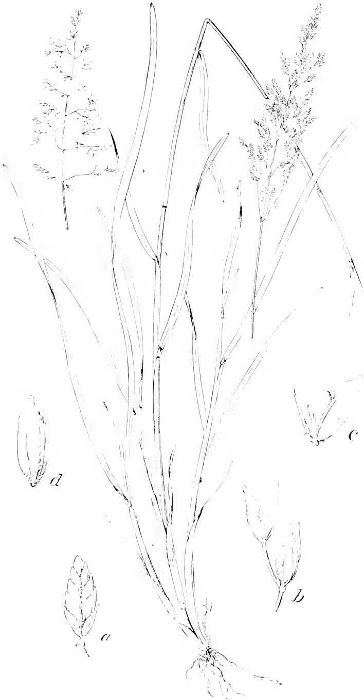
POA PSEUDOPRATENSIS Scribn. & Rydberg.